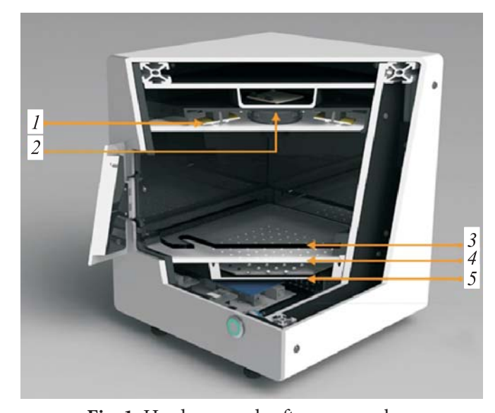
Fig. 1. Hardware and software complex: 1 is upper radiation source; 2 is camera with lens; 3 is cassette for placing grain samples; 4 is light scattering plate; 5 is lower radiation source

A hardware and software complex developed by the authors was used for experimental studies [15] (Fig. 1). The complex consists of upper and lower sources radiating in the visible and infrared ranges, scattering plate, special cassette with 100 cells for placing grain samples and television camera with a lens transmitting digital images of grains to the personal computer for consequent processing.