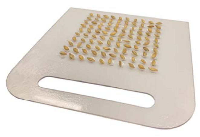
Fig. 2. Test samples arrangement in the cassette

consisted of two blocks, including digital image segmentation and general vitreousity calculation.